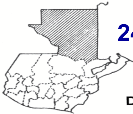
Department of Peten, Guatemala

31 Acupuncturists practice in 24 communities in five municipalities